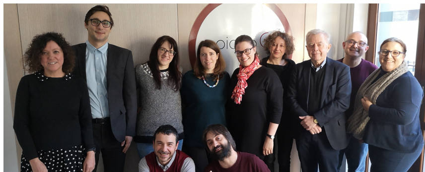
Fourth meeting of the partners in Milan, Italy in January 2019

We are pleased to share with you some updates on the MOM project. MOM – Maternity Opportunities and Mainstreaming, a European Project funded by Erasmus+, aims at framing maternity as a learning experience that provides mothers with soft skills that are extremely useful in today's workforce.