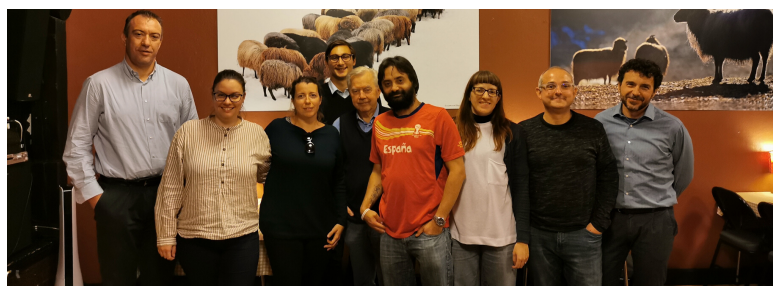
Fifth meeting of the partners in Oslo, Norway in September 2019

The MOM partners wish you a wonderful holiday season. We look forward to seeing you in the New Year. Enjoy the course that was developed with you in mind.